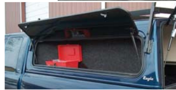
Shown with radius fiberglass doors also available with side access windows