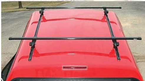
Pannon roof rack