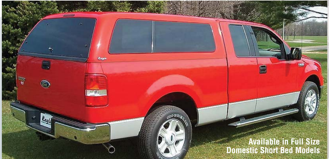
Available in Full Size Domestic Short Bed Models

This striking model hugs the lines and curves of your truck like no other cap on the market today! All hand made and custom fit to your truck with features that will enhance the look and value from the day it's installed until the day you trade. You'll appreciate the greater strength and structural integrity