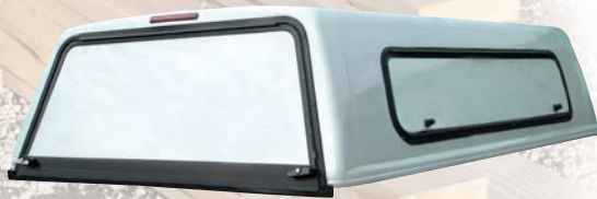
Fiberglass rear door